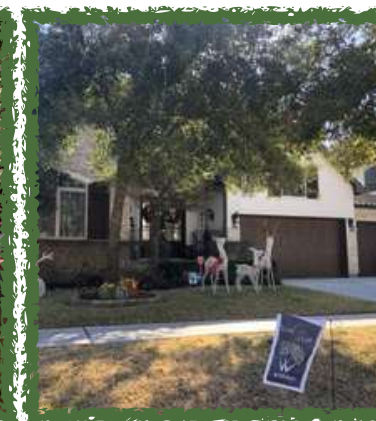
October 4115 Levonshire