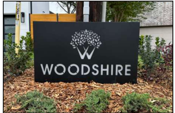
Latma & Glenshire/Fordshire

Thank you to these and other volunteers who are making our neighborhood a more inviting place. The