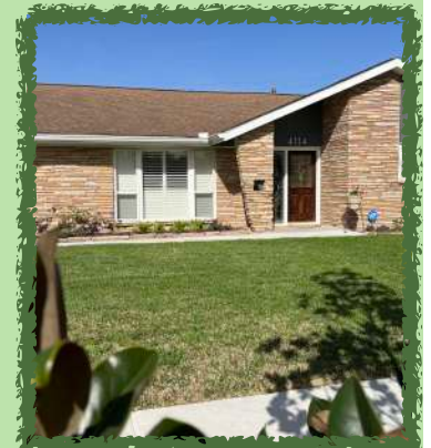
4114 Mischire with fresh boarder plants, blooming bushes, and a lovely magnolia