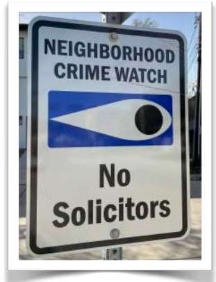
New signage placed at Latma and Leeshire entrances