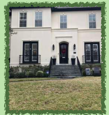
4142 Glenshire with well manicured bushes that withstood the freeze