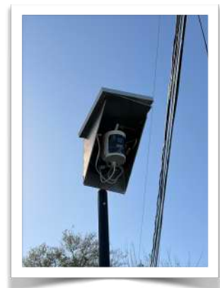
Camera installed at the Latma & Fordshire/Glenshire intersection

D istrict K Youth, ages 16-24 years old, are encouraged to apply for summer jobs through the Hire Houston Youth Program. Apply early! Application screening begins March 27th. For City of Houston internships, scan the QR code. For non-city opportunities visit HireHoustonYouth.org . Good Luck!