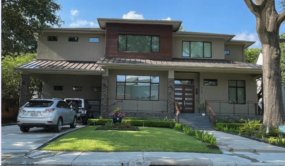
June - 4126 Levosnhire