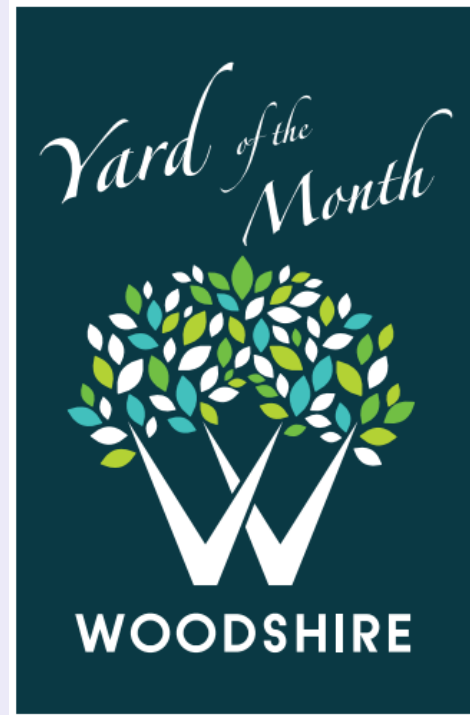
July - 4130 Martinshire