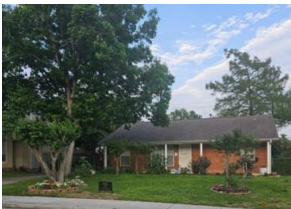
APRIL – 9105 FORDSHIRE