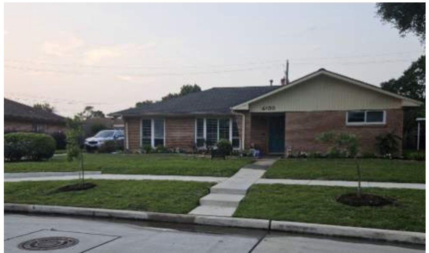
MAY – 4130 MISCHIRE