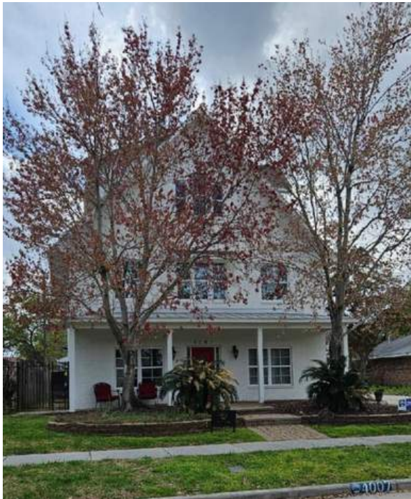
MARCH – 4007 LEESHIRE