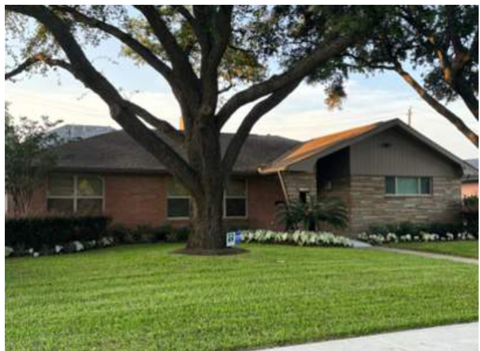
JUNE – 4142 MISCHIRE